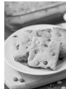
Brownie Mix // Cake Mix and Frosting