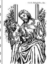
St. Joseph’s Day Feast of St. Joseph

The Feast of St. Joseph is celebrated on Monday, March 20 this year, because when a Feast Day falls on a Sunday in Lent or Advent it is celebrated on Monday. We will have a parish liturgy at 7:30 pm on March 20 followed by a social featuring St. Joseph’s bread and pastries in the Spiritual Formation Center.