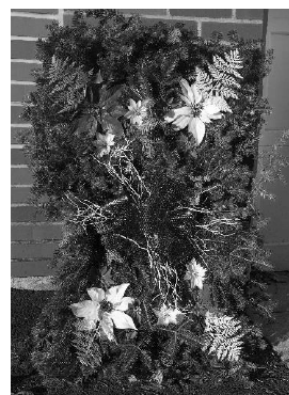
ITEM C Grave Blanket 16 inches by 32 inches Decorated Balsam Fir