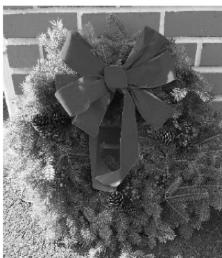
ITEM A Natural Décor Wreath 12 inches Decorated with pinecones and berries

Drop form at parish office or email Beth Miloscia at youthmin@stmarysdumont.org