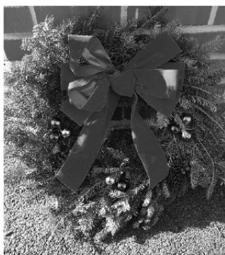
ITEM B Holiday Ball Décor Wreath 12 inches Decorated with pinecones, berries and Christmas balls