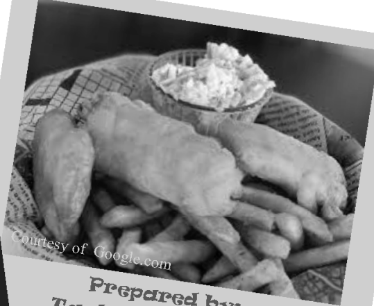
Prepared by: Tastefully British

All proceeds to benefit St. Mary's Church.