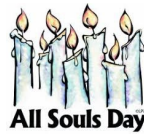
All Souls Day

On Thursday, Nov. 2, the Church remembers the souls of all those who have gone before us, marked with the sign of faith.