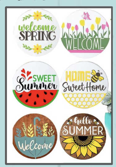
You will be able to choose ONE of the projects above

RSVP May 1, 2024 St Mary's Church Szelest Hall B.Y.O.B. & SNACKS *ADULTS ONLY*