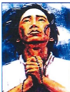
San Lorenzo Ruiz