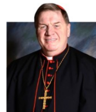
Archbishop of Newark Cardinal Joseph W. Tobin, C.Ss.R., D.D.

As we welcome the New Year, Cardinal Tobin invites all Catholics in the Archdiocese of Newark to read We Are His Witnesses , his pastoral letter outlining new pathways for the future of the Archdiocese. Rooted in Pope Francis' call for pastoral conversion, missionary discipleship, and synodality, the letter reflects on our shared journey of faith and calls us to embrace renewal, collaboration and missionary outreach. This multi-year initiative will guide us in shaping a vibrant, hopeful future for our Church community. Read We Are His Witnesses in the Archdiocese of Newark website and join this journey of faith as we respond to Christ's call to be His witnesses in the world.