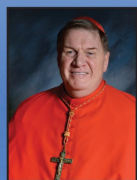
Cardinal Joseph W. Tobin, C.S.B.