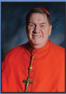
Cardinal Joseph W. Tobin, C.Ss.R.