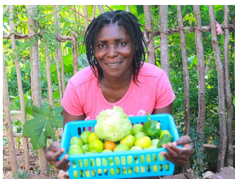
A member of the Family Sponsorship program with her food basket.