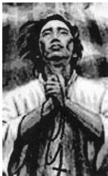
SAN LORENZO RUIZ

A joint Eucharistic Celebration in honor of