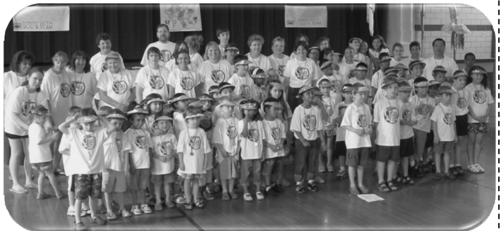
Above is the group photo from our Son Games Olympic-themed VBS from 2008.