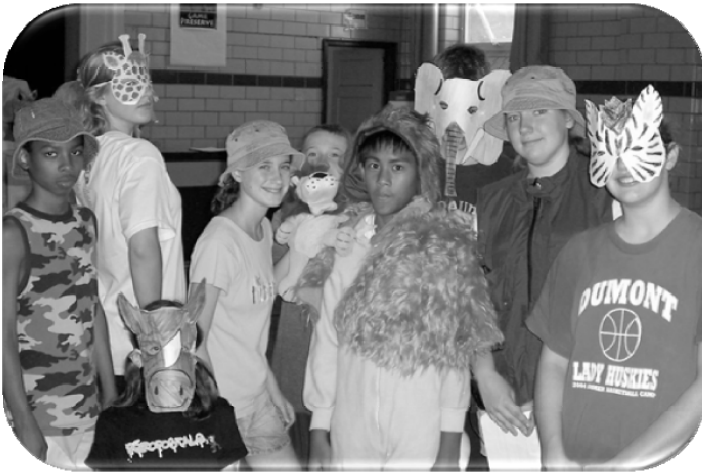
Teens really get into portraying the animal characters at our first VBS, Safari Adventure, in 2005. Many of these former teens have remained involved throughout their high school years and beyond.