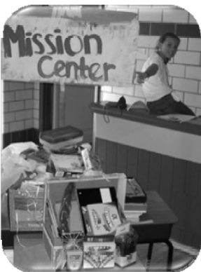
The Mission Center from our Son Treasure Island VBS 2006