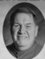
Cardinal Joseph W. Tobin, C.Ss.R. MAIN CELEBRANT AT MASS

To register online visit NJcatholicmen.org