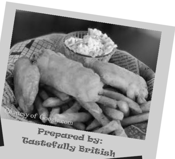
Prepared by: Tastefully British

4th DRIVE-THRU FUNDRAISER All proceeds to benefit St. Mary's Church.