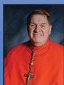
Cardinal Joseph W. Tobin, C.Ss.R.