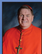
Cardinal Joseph W. Tobin, C.S.B.